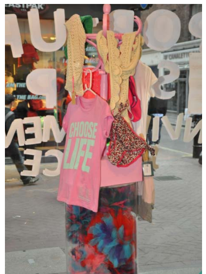
Images: Top: Upcycled label Goodone modeled by a Social attendee Bottom: Ethical fashion displays at the Pop Up Shop