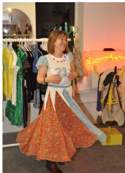
Images: Top: Guests browse the pop-up shop Bottom: Guest trying on the fabulous ethical fashion- Ciel's up-cycled Think Act Vote campaign t-shirt

Interested in the Ethical Fashion Social? See website for more information on how to become a Social Host.