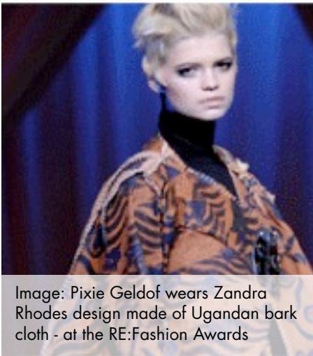
Image: Pixie Geldof wears Zandra Rhodes design made of Ugandan bark cloth - at the RE:Fashion Awards