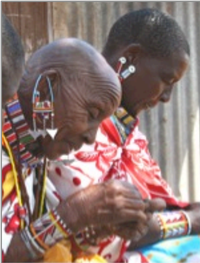
IMAGE: Women from the Namayiana fair trade cooperative in Kenya, supported through the work of EFF