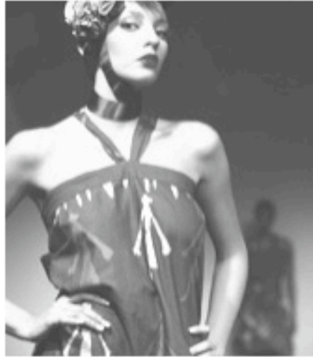
The DESIGN4LIFE GHANA project raised wages in Ghanaian women's cooperatives tenfold.