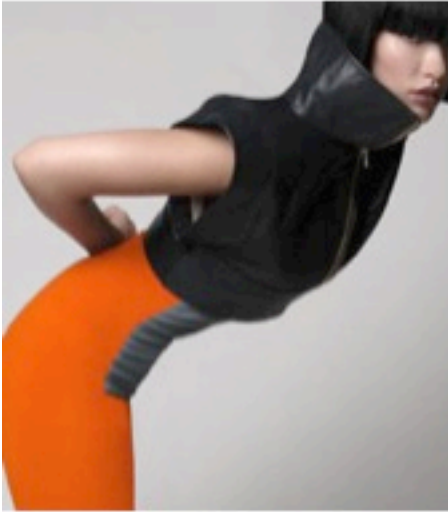
The INNOVATION AWARDS, launched in 2007, have changed international perceptions about ethical fashion.