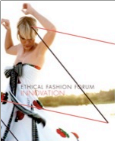
IMAGE: Design by INNOVATION winner Laesso, supporting slum communities in Kenya