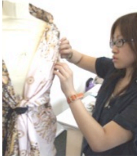
EFF's work with the BBC raised awareness about sustainability amongst thousands of young people.