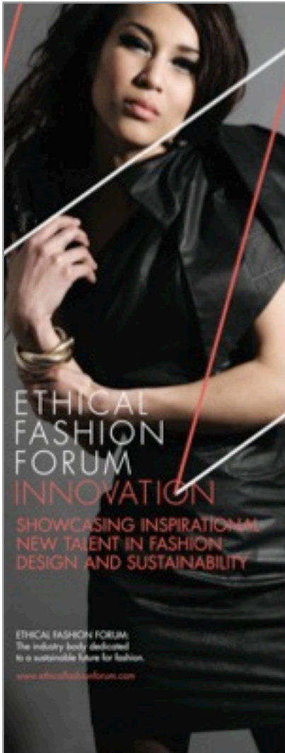
IMAGE: Design by INNOVATION winner SIKA , whose ranges are sourced and produced in Ghana, supporting communities and changing lives there.