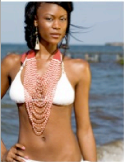
IMAGE: Design by ZANAA, a fashion label changing lives in Uganda, supported by EFF